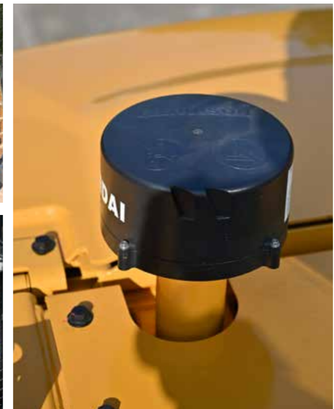
Fold-back air pre-filter