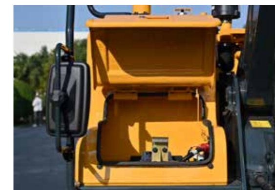
Additional storage or grease gun