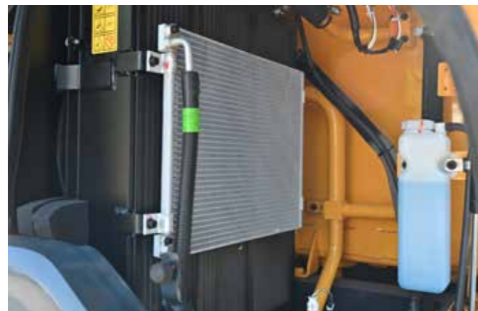
The cooling fan diameter and number of blade (7 to 9) increased for better heat dissipation.

The maximum flow rate of the main pump is 158.4+17.6lpm. New load sensing system provide faster independent action a low fuel consumption.