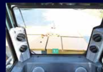
Better Rear Visibility

In order to reduce the fatigue of the driver's performance, HX75S provides a comfortable operating environment for the pilot.