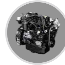
High-Performance Yanmar Engine