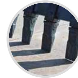
Reliable Bucket Pin Type