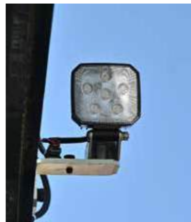
Standard LED Lamp