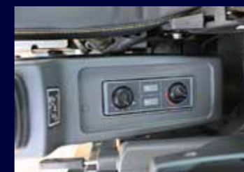
Improved Air Conditioning System